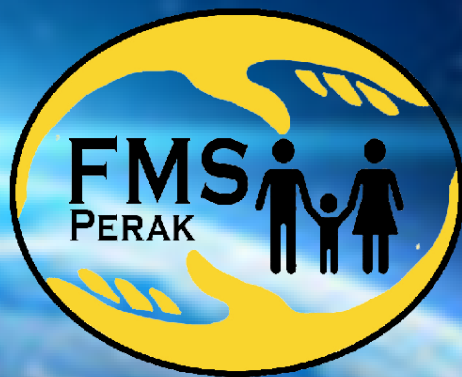
Family Medicine Specialists' Association Perak