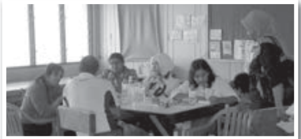
Medical exam in progress