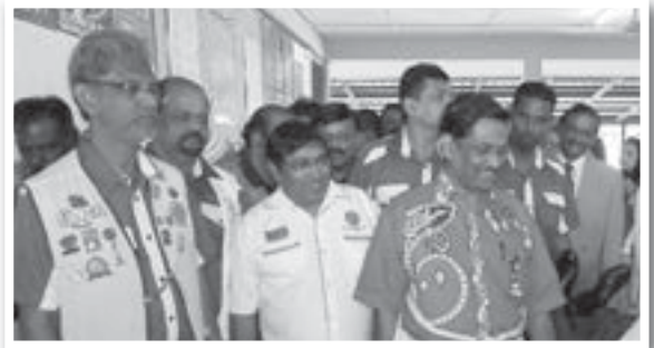
PMPS in the forefront with Honorable Minister