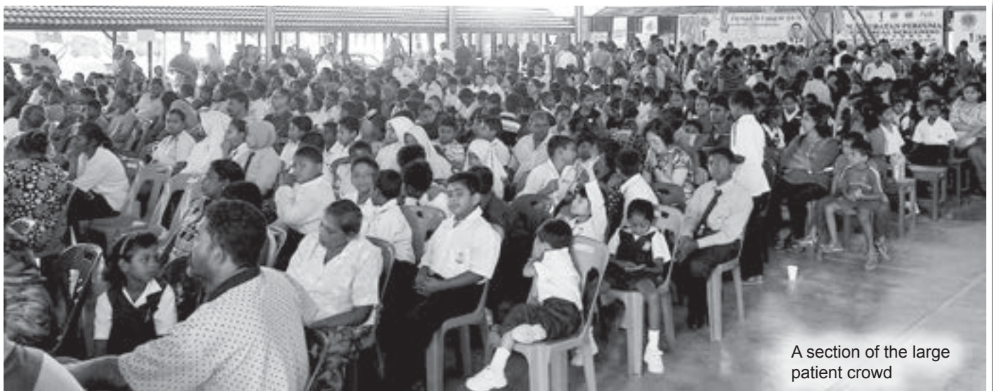
A section of the large patient crowd