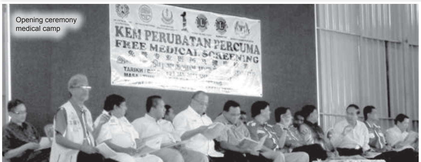
Opening ceremony medical camp