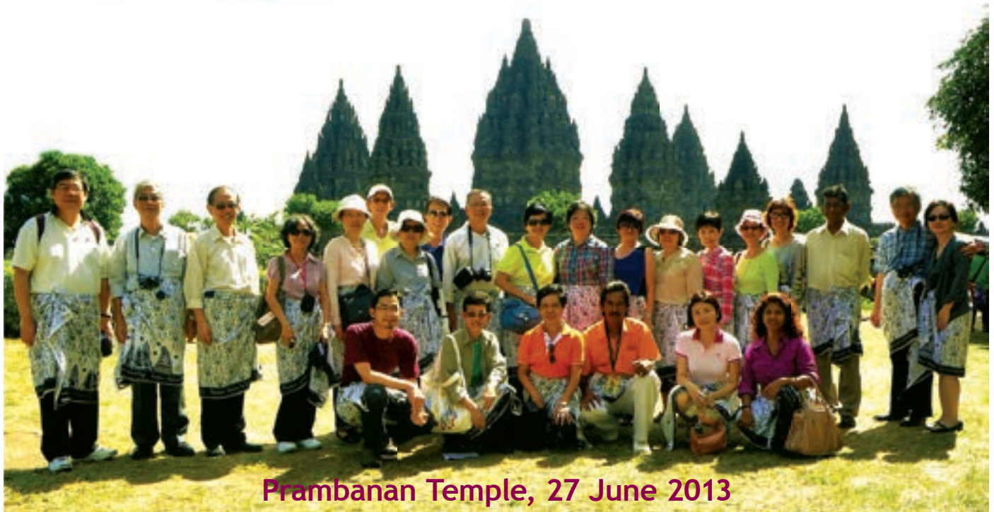
Prambanan Temple, 27 June 2013

Already registered are 30+ pax. All awaiting eagerly to go!