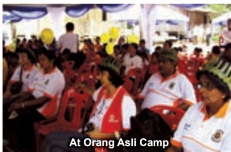
At Orang Asli Camp