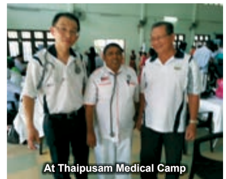
At Thaipusam Medical Camp