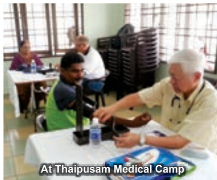
At Thaipusam Medical Camp