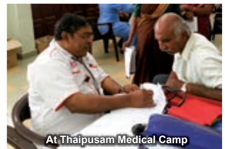
At Thaipusam Medical Camp