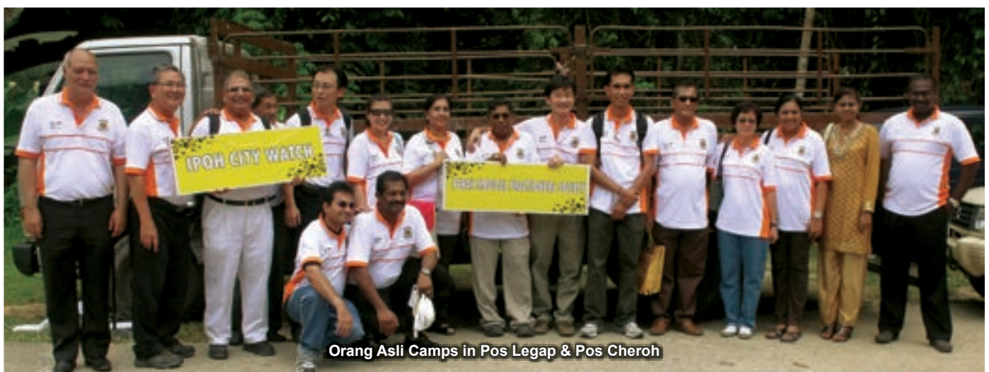
Orang Asli Camps in Pos Legap & Pos Cheroh