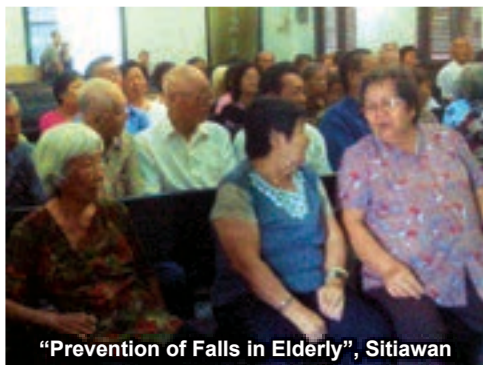
"Prevention of Falls in Elderly", Sitiawan