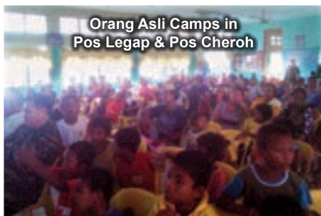
Orang Asli Camps in Pos Legap & Pos Cheroh