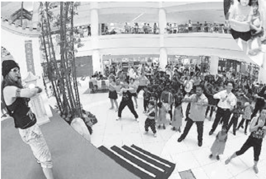
PMPS Zumba in Ipoh Parade