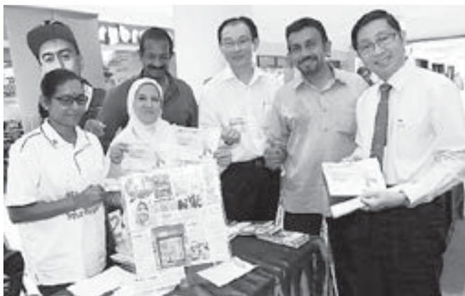
Organ donation pledge