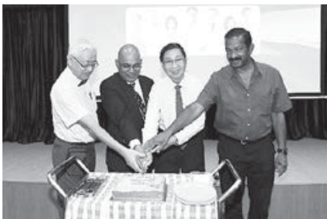
Doctors' Day Cake – gift from Hospital Fatimah