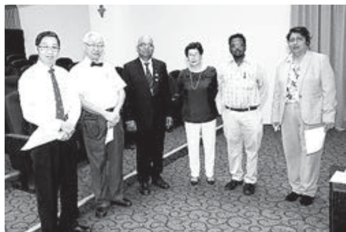
4 Speakers (right), Public Forum, Hospital Fatimah