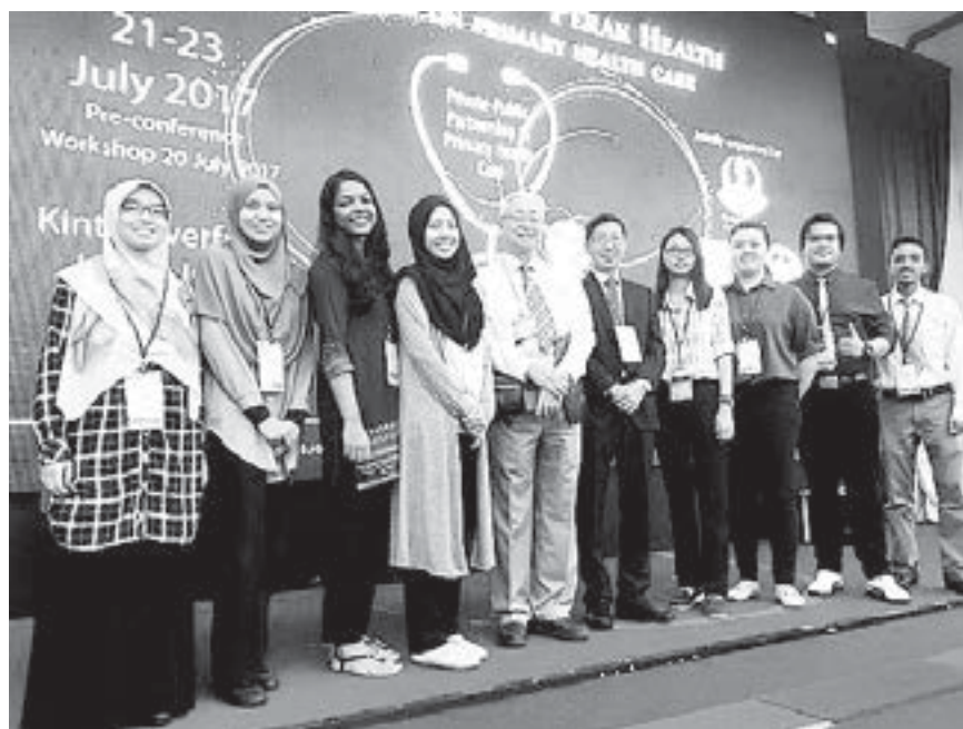
Some Medical Students at the Conference