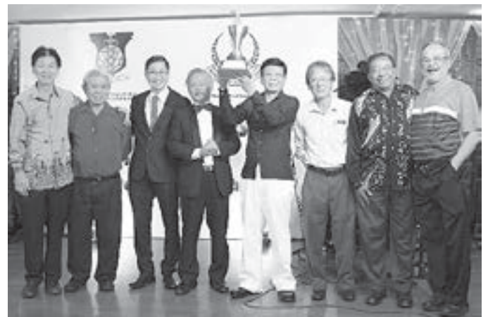
Golf Federation Cup winner – PMPS Team