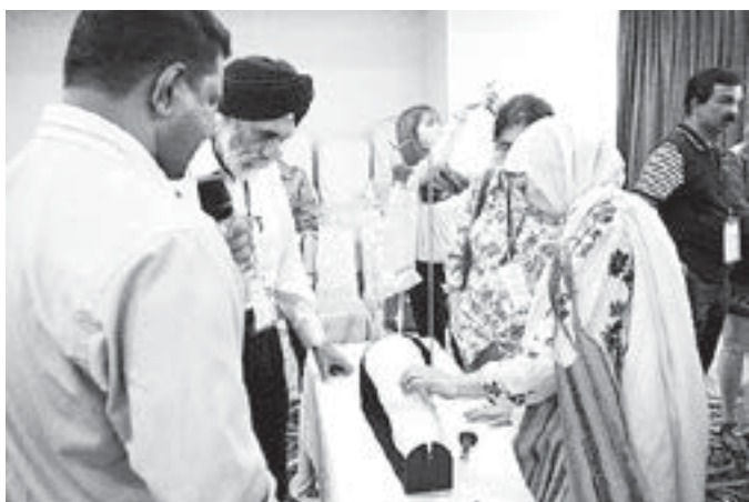
Pre-Conference Workshop – Injection Procedures