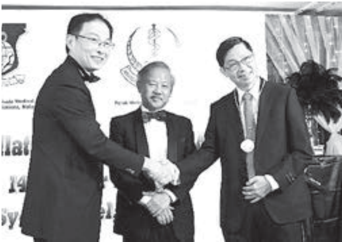
Successful handing over taking over