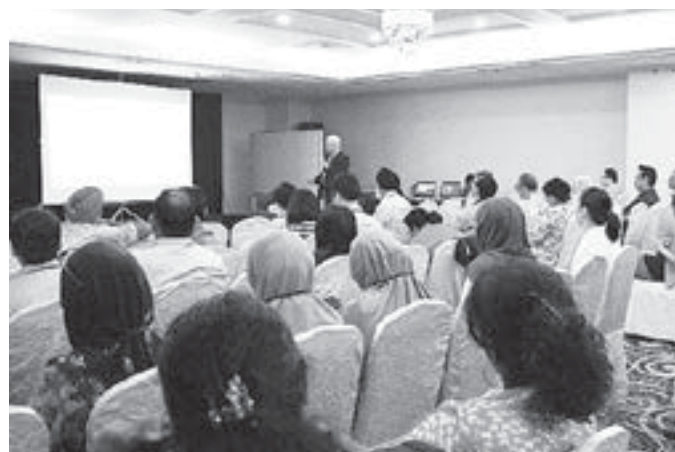
Pre-Conference Workshop – Dementia Care

and generated lots of laughter and participation from the audience.