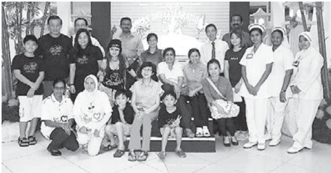
Group at Community Service, Ipoh Parade