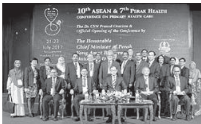
Organising Committee at the Opening Ceremony

The organising committee of 22 members, started organising this event one year ago. PMPS together with the Postgraduate Medical Education Society and Association of Public Health Physicians, came together to make this event a success that it was. The theme of the conference was Private-Public Partnership in Primary Health Care.