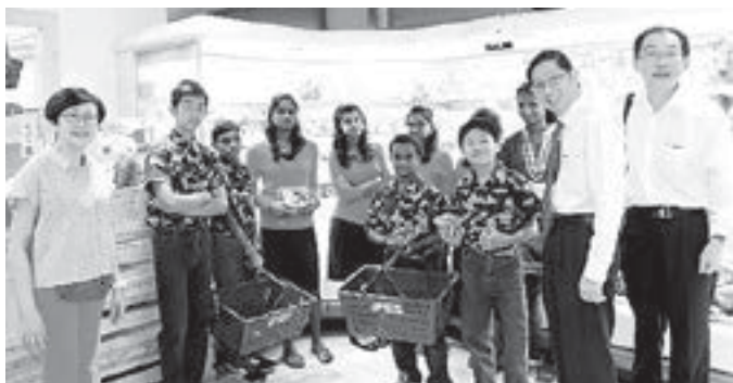
Shop run at Jaya Grocer