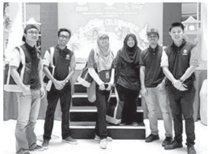
The happy medical student volunteers, UniKL RCMP