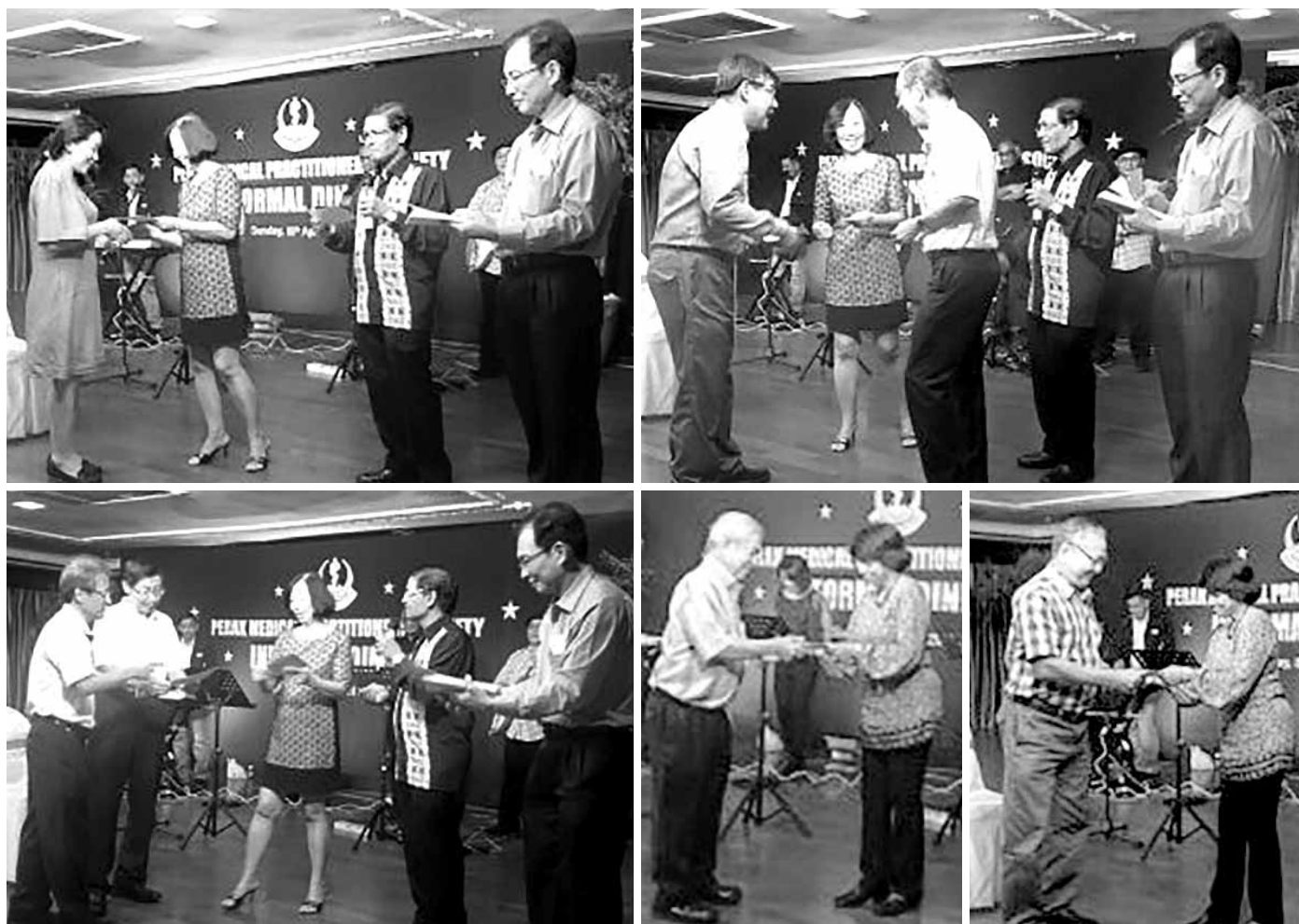
PMPS Sports Awards