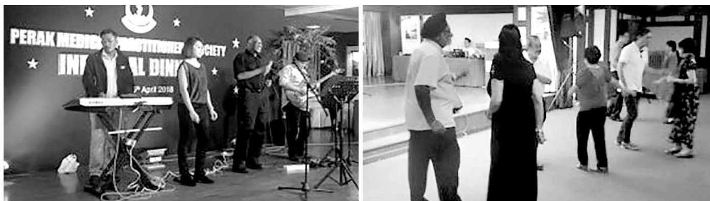
Games, Songs and Dances