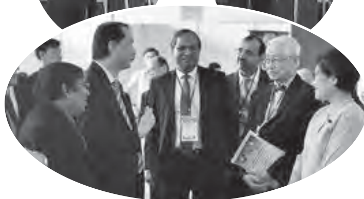
With DG & State Health Director at Trade Exhibition