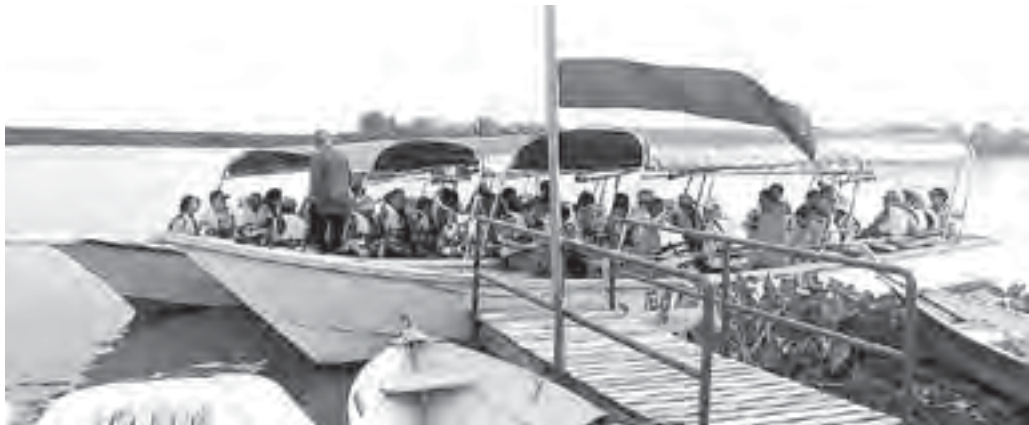
At Perak River Cruise jetty