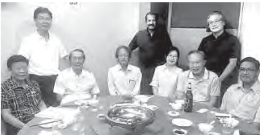
PMPS Golf 2019 Committee & PMPS Sports Coordinators