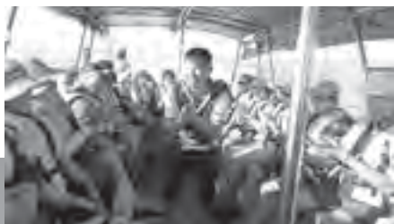
Sky Mirror's hilarious tour/ photography director