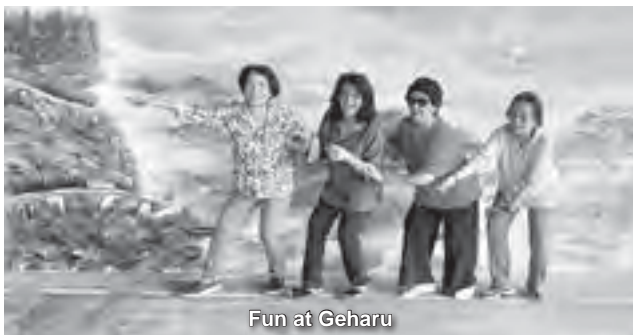
Fun at Geharu

We saw the sun set and in the darkness we also saw fireflies. Dinner was another satisfying seafood menu at a local restaurant. After spending a night in Teluk Intan's Grand Court hotel, we were off to an early start the next morning.