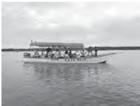
Waiting for sunset