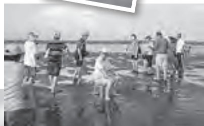
our two beloved most senior members