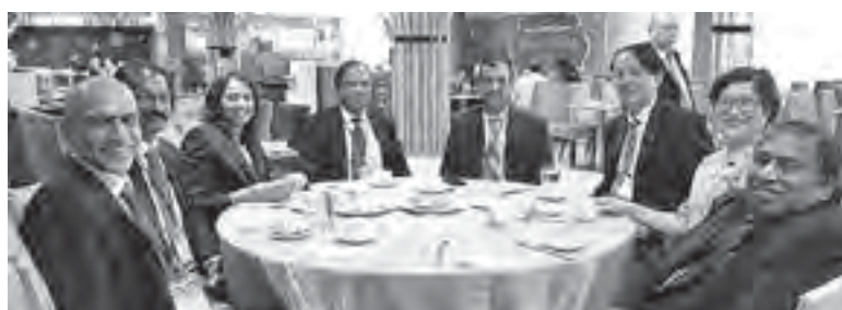
Tea with DG & State Health Director