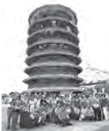
Teluk Intan Clock Tower