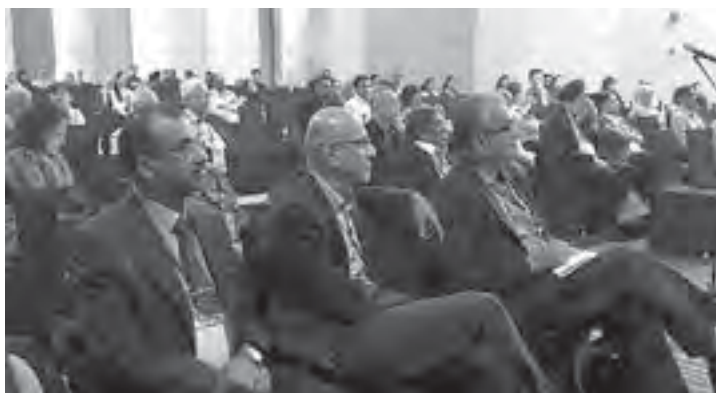
Never too senior to learn