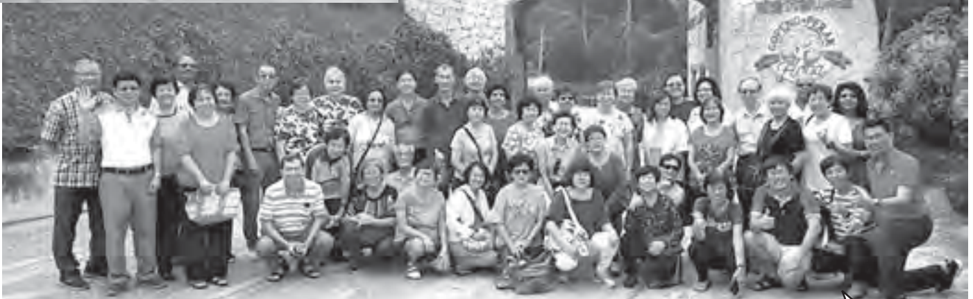
Geharu Tea Valley