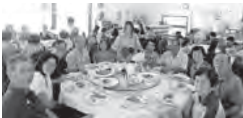
Tg Tualang Prawn Village

Tg Tualang Prawn Village was our next stop. This was a fairly new restaurant serving the famed tualang big-head prawns and other fresh seafood.