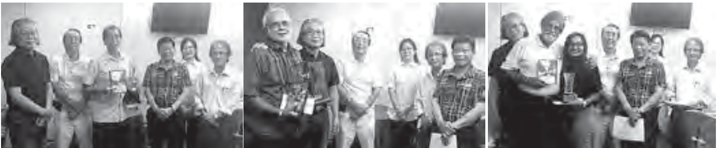
The PMPS Golf 2019 Champions of three categories