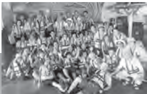
All 44 of us!