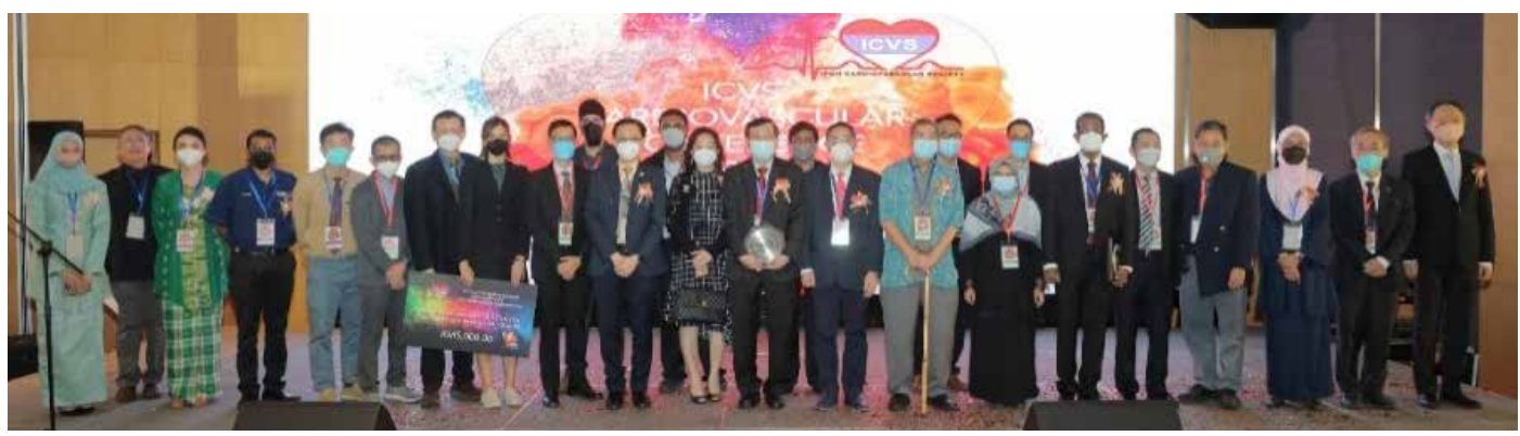
ICVS Conference opening ceremony, Weil Hotel, 13-14/8