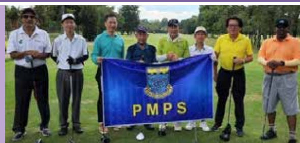
Golf – RPGC