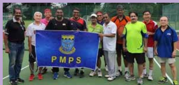
Tennis – YMCA

There was an exchange of souvenirs where we gave them pomelos and 'kacang putih' and in return they gave us copies of their souvenir book, "To Heal The Sick".