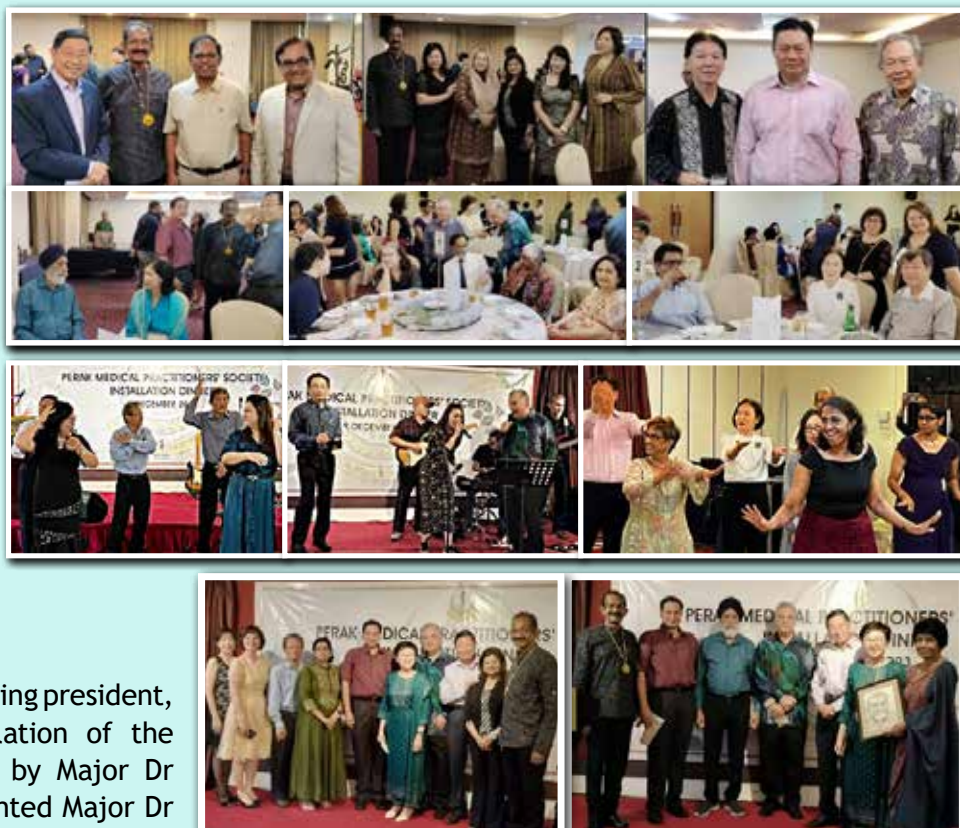
The new Committee (two members unable to attend)