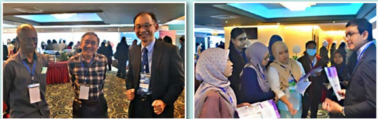
Delegates at Exhibition