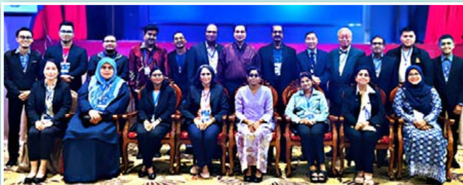
The hardworking team