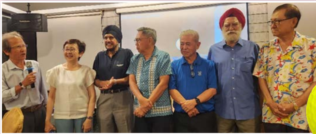
Affirming and recognising the strong and hearty!