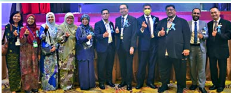
Perak government Hospital Pengarahs