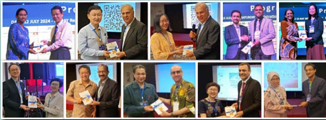
Some Congress speakers