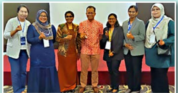
Perak government Health Clinic Family Medicine Specialists & State Health Director